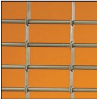
G-8 Pattern (Optional) – Straight 4” spacing