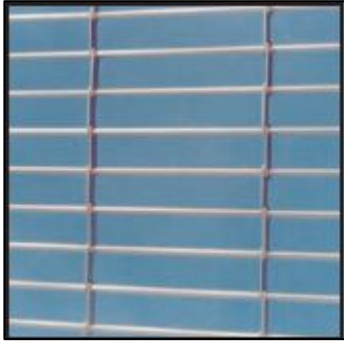
G-6 Pattern (Standard) – Straight 9” spacing